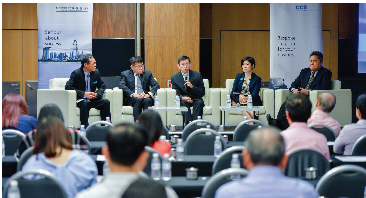
Panellists for the Moore Stephens-CCS Financial Reporting Seminar 2018

Thereafter, the seminar was thrown open to the floor for questions from participants, following which tokens of appreciation were presented to the guest speaker. The seminar ended at 5.30pm.