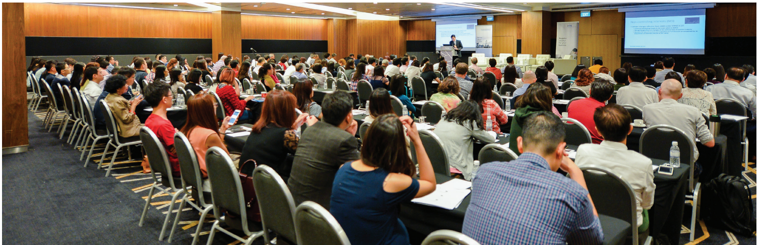
Delegates at the Moore Stephens-CCS Financial Reporting Seminar 2018

financial reporting pronouncement relating to revenue from 1 January 2018, also includes rules on cost capitalisation, which has become more prescriptive. Another commonly-overlooked area is that the new revenue requirements extend to certain non-revenue gains related to disposal of long-term assets. Finally, Singapore property developers, when applying SFRS(I) 15, should remember to consult the conclusions published by the local professional body, the Institute of Singapore Chartered Accountants, in 2017, relating to timing of revenue recognition on sale of standard residential properties, executive condominiums,